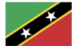
St Kitts & Nevis